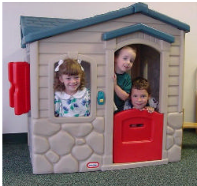
Young Bellefielders enjoy the new play schoolhouse bought as part of the Nursery renovations.