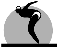
How about 8 Golds in feeling?

these feelings by prayer for them v. 9. Here the reference to "love and knowledge" shows the inseparability of biblical content to inform love. Love is not mere sentimentality: it is anchored in divine truth. He finalizes stimulation to godly feelings by his passion for the God's glory & praise (v. 11).