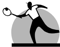
Take some swings at feeling

Bellefield remains committed to glorifying God with our 5 stated Biblical core values. The fifth one of those is glorifying God through "fostering deep relationships." We're tired of the superficial, the inane and the shallow. We want to be real. Distance doesn't glorify Christ; connections do. We understand that passionate beliefs eventuate in changed behaviors . So what about these beliefs?