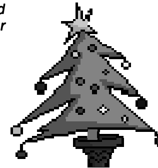
His family tree reaches to us.