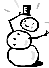
Frosty, don’t lose your head.

lied like Pinocchio. Then there’s Jacob, slicker than a Las Vegas card shark. Then Uriah is mentioned with David—what a sad happen-