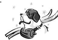
Never give up hope.

of 14 generations of OT happenings. God makes sense out of nonsense. God hits good licks from crooked sticks like you and me. History may look like a trillion piece jigsaw puzzle, but the truth is, God is working out His sovereign purpose in all of human history despite the Hitlers, the Sadam Husseins, the US economy, et al.