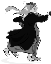
God leads all the way.

Genesis, God said to Abraham, “I’m going to give you a son, & that son will have a son, & that son will have another, until someday far down the line of the sons, the Savior of the world will be born.” Now Matthew’s gospel is written to Jewish