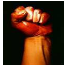
Will you open this & forgive?

“What then is the miracle that happens after confession is made? When one confesses & the other forgives? When a hurting person forgives the person who hurt her?”