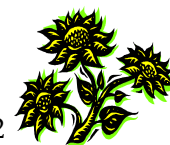
Caption describing picture or

When you put these 2 together, you must ask, "What then really happens to you when someone you have hurt turns to you and says, I forgive you. " What happens to you when you say, I forgive you. " What is this miracle of forgiveness?