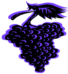
Confessing & forgiving hang together in Christ

1 John 1:8 “If we confess our sins, He is faithful and just to forgive us our sins....” Now we must not put more content into this than it says. The text does not say if you do not confess, He will not forgive. No, it only says that if we do confess, we are