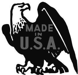
We are thankful for all who made us.

and naked we shall return there” ( Job 1:21 ). But still, take the list with you. For “On that bright and cloudless morning when the dead in Christ shall rise, and the glory of His resur-