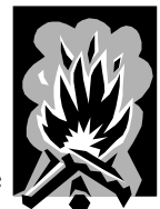
Around the campfire.

testimonies, memorials. They show that the Word of God validates our honorable processes of memorializing our friends, our soldiers, our loved ones. So take some paper & write some names.