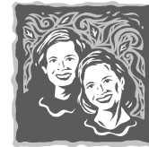
Twins Tryphena & Tryphosa

parish that's far away. He's now about 60 years old. He'd gotten a late start in ministry, probably around age 35, so he wants to keep going. So as he packs his coat, his books & a few other things. He comes across some notes he's