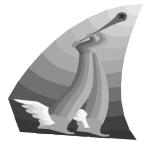
The trumpet shall sound 1 day.

Romans 16:1-16 shall sound and time shall be no more, and the morning breaks eternal bright and fair, when the saved of earth shall gather over on the other shore...” can make you think of, “From the halls of Montezuma to the shores of Tripoli, we will fight our countries battles over land and air and sea...” And more tunes too. has a list of names as the Word of God written. This could make you think of a roll call of names. The old song goes, “When the trumpet of the Lord Shore. Now that word