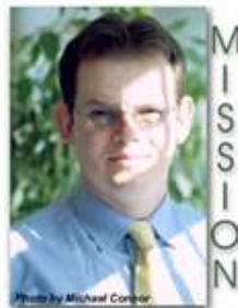
That everyone may hear.

God has given grace to Bellefield to the degree that we love missions. To our amazement as "least of all the saints," He has us join Him in His eternal purpose realized in Christ Jesus our Lord. So this week's mission: let us seek someone out ask them if they will let us tell them about how God has poured grace into our lives through the Lord Jesus Christ. If they listen and do not care, well, "don't lose heart."