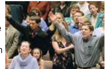
The Holy Spirit does this.

built together into a dwelling place for God by the Spirit." Here is our first and chief identity as Christians—not first as individuals, but